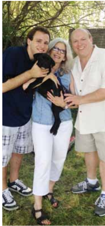
Sammy, Sandy, Andy and Sage

It was a cold February day, the coldest one of the year in fact, when a gentleman and his son were hiking through the woods. Far into the frozen woods, past icy trees and deep snow drifts, the two men came upon a bundle of blankets. In the blankets were two large cats huddled together trying to keep warm, with a pile of dry kibble lying next to them. The two men acted quickly and bundled up these two very friendly, but cold and lethargic cats and took them home. The cats were fed and given water and plenty of warmth. Unfortunately, they could not keep the cats and made the decision to bring them to MARL. Now here at the shelter, they're receiving plenty of love, mending their frost-bitten paws, and preparing for "new lives" in a new home.