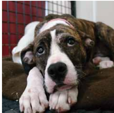
Too Many Surgeries