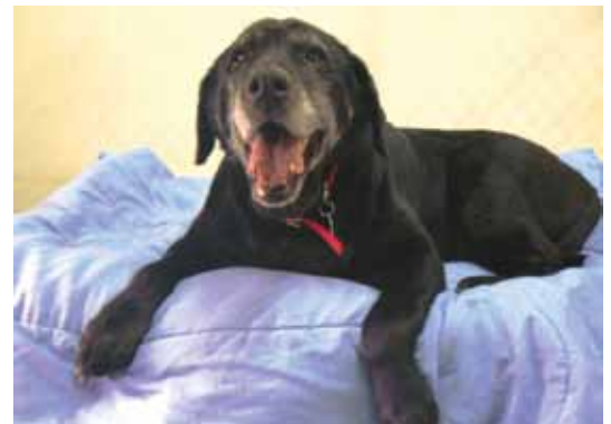
WAY to OLD