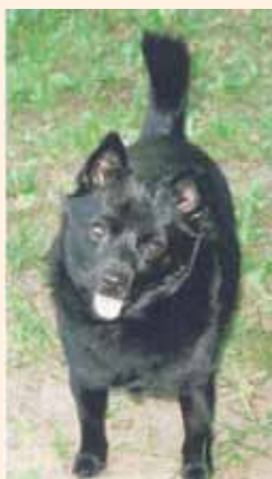
In Memory of Molly Half Schipperke, Half Chihuahua - All Mule 2003 - 2012