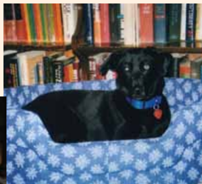
Blue Russell 1997-2013 "Well done, good and faithful friend"

He was such a great dog... We are forever grateful that we found him at MARL